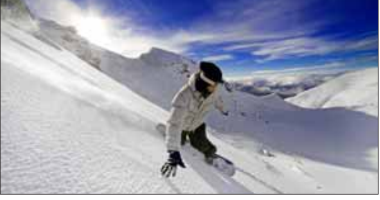
Ski and snowboard in the Alps Nov. 13-15 with ODR.

• Olive Harvest: Kids' Day at the "Frantoio" Nov 8 from 1-7 p.m. Harvest olives and watch them turned to oil.