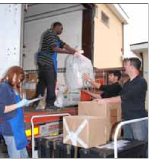
Installation postal service employees load outgoing mail Tuesday.

"With this contract the Vicenza postal service center is afforded the same privilege that See NEW CONTRACT Page 3